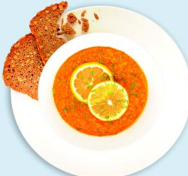
Kumara, red lentil and dill soup served with sourdough seeded bread