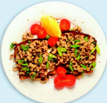
Bruschetta piled with black-eyed bean, lemon and shallot salad