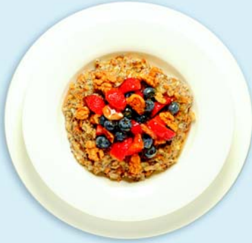
Multigrain chia seed porridge topped with walnuts, dried white figs and berries