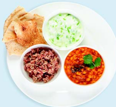
Yellow split-pea curry with Persian lime, red and wholegrain rice combo and yoghurt cucumber salad