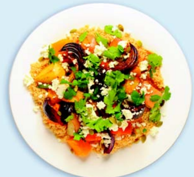
Roasted vegetables on wholegrain couscous with Moroccan dressing, pepita seeds and fetta

meal (eg, wholegrain spaghetti, canned brown lentils and a tomato-based pasta sauce for spaghetti bolognese).