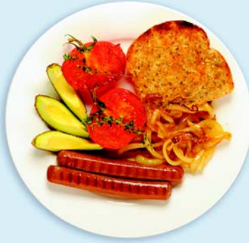
Vege sausages with grilled tomato, avocado, caramelised onions and café-style grainy toast