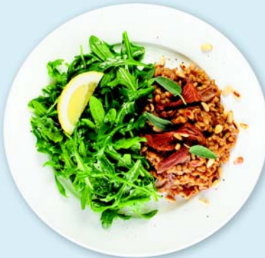
Barley risotto with porcini mushrooms, pine nuts and sage and dressed rocket salad