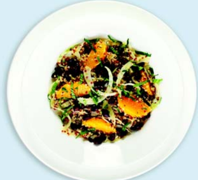
Quinoa salad with black beans, shaved fennel, orange slices and mint